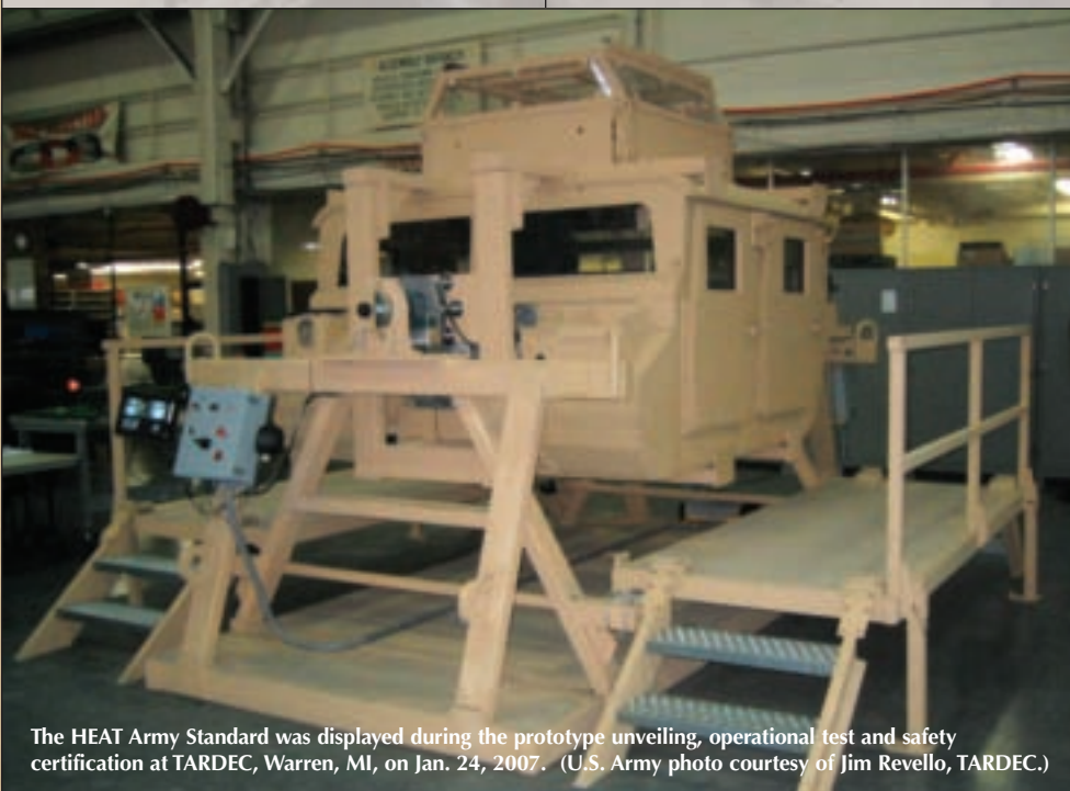
The HEAT Army Standard was displayed during the prototype unveiling, operational test and safety certification at TARDEC, Warren, MI, on Jan. 24, 2007.

With the assistance of PEO STRI leadership, the IPT made two key