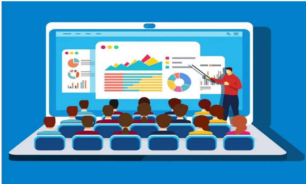
Supervisor Human Resources Orientation Course (SHROC)

Supervisors are now auto-enrolled in SPV-101, SDC and SDC-R. They manually register for SHROC and CES through CHRTAS. SPV-101, SDC, and the SDC-R are all online training courses. SHROC is conducted in a live, face-to-face, or virtual format. New supervisors are auto-enrolled in SPV-101 in the first month of assuming a supervisory position and SDC in the eighth month. Every three years, supervisors are auto-enrolled in SDC-R in the 32 nd month. Those needing to complete the courses are identified and notified by e-mail for each course. SDC-R contains five modules consisting of 19 lessons with the ability to test out of each module. We are phasing-in the supervisor certification program for new supervisors effective 1 October 2022. Those who are past-due on SDC-R are also being auto-enrolled, and existing supervisors will enter the recertification process upon their next SDC-R completion, beginning in Q2 FY23.