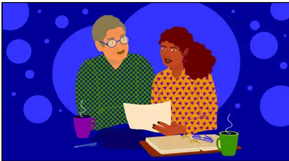
Coaching and Mentoring

The Coaching and Mentoring Guide focuses on 11 recommended topics derived from the OPM leadership competencies (Copy link and paste in web browser: Proficiency Levels for Leadership Competencies (opm.gov) ) and facilitates the development of increasing proficiency levels throughout every echelon of supervision. Included are resources to learn more about the topic, vignettes and role play scenarios to practice skills with feedback from the supervisor, and discussion questions to promote thinking about how the new supervisor would react in certain situations and incorporate what they learned from the resources and role plays. Experienced supervisors and leaders are encouraged to add topics, competencies, and resources to meet their specific mission requirements to achieve the Army's objective of developing world-class supervisors and supporting the civilian workforce. In addition to meeting legal mandates, an overarching goal is to foster open dialogue and build trust and rapport.